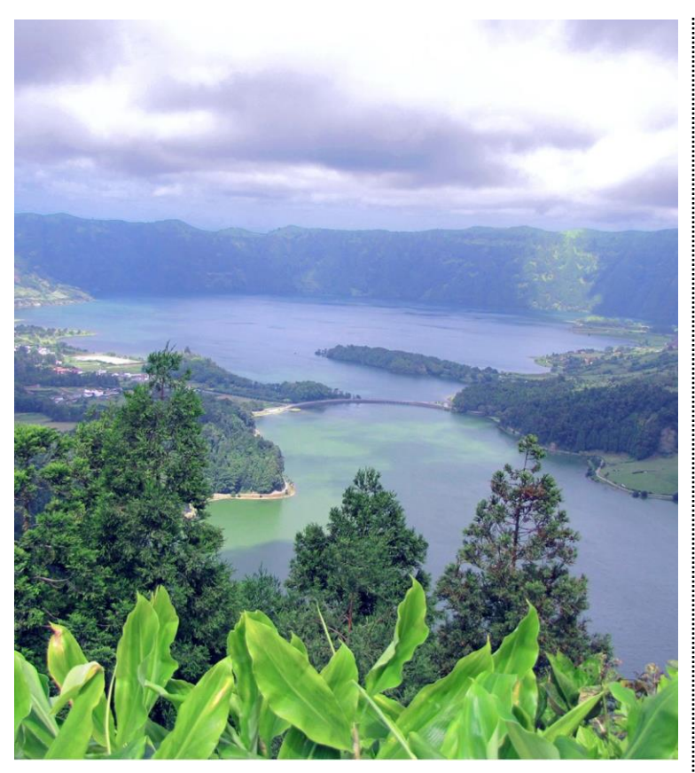
14 Days • 19 Meals: 12 Breakfasts, 1 Lunch, 6 Dinners

HIGHLIGHTS... Lisbon, Belem, Fado Dinner Show, St. Michael Island, Azores, Choice on Tour: Garden Guided Walk or Thermal Pool Experience, Terra Nostra National Park, Sete Cidades, Madeira Island, Espetada Dinner, Folkloric Show, Porto Moniz